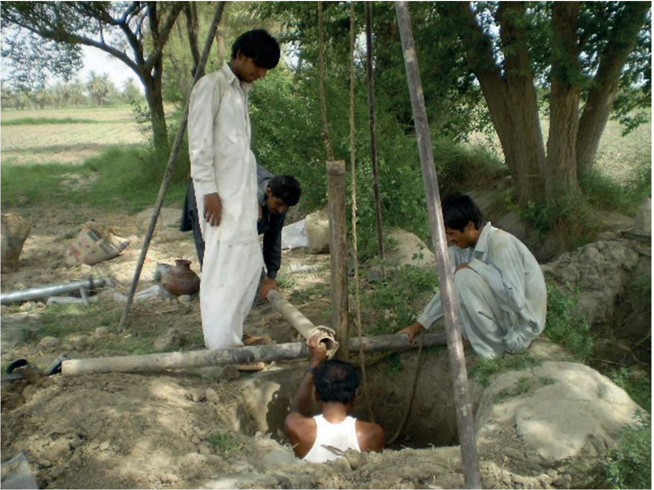
Photograph A for Question 5